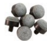
Screw In Tips