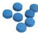
Glue On Tips